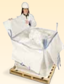
Super Waste Away™ www.bagcorp.com/p_su_haz_superwasteaway.php