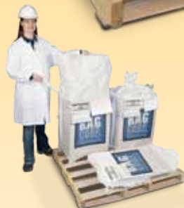
Mini Waste Away™ Drum www.bagcorp.com/p_su_haz_drummini.php