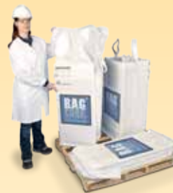
Waste Away™ Drum www.bagcorp.com/p_su_haz_drum.php