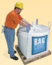
Super Sack® LandFill (No stiffeners; not self-supporting) www.bagcorp.com/p_su_haz_landfill.php