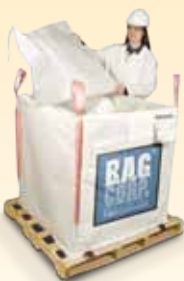
Waste Away™ Plus www.bagcorp.com/p_su_haz_wasteawayplus.php