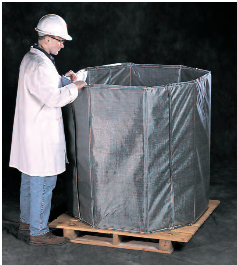
The PelletPack container is ready to use - just open and fill! It is lightweight and durable, and collapses for easy storage and handling.

Square in shape, with its innovative reinforced stacking corners and all of the features of the basic PelletPack container, the PelletPack Plus container is the 'ultimate' stackable FIBC.