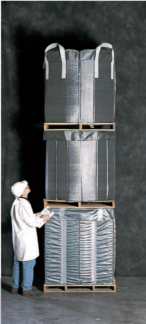
Two PelletPack containers each filled with 2,200 lbs. of product easily stack on top of a PelletPack Plus container.