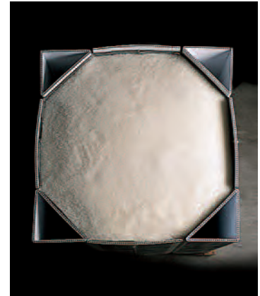
Top view of the PelletPack Plus container with its innovative stabilizing stacking corners.