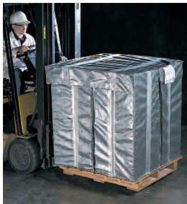
The PelletPack® Plus container easily handles 2,200 lbs. of product.