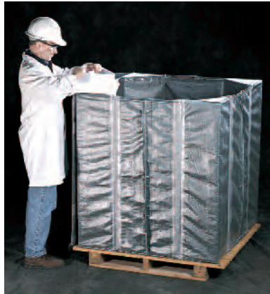
Stacking corners are easily inserted into the PelletPack Plus container.